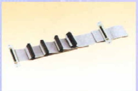
HPD68 F WITH BRACKET*2-HPD68M*4